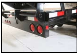
Sealed beam lighting