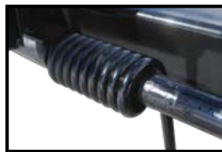
Spring assisted ramp