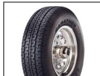
➤ Goodyear Marathon Radial Tires