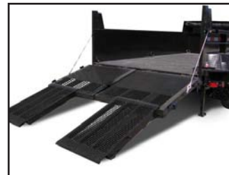
➤ Patented EZ 2 Load Ramps