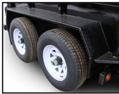
➤ Checkerplate Fenders