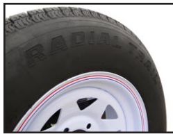
➤ Carlisle Radial Tires

*Trailers in photos may contain optional features