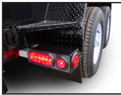
➤ LED Lights