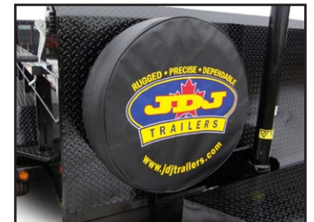
➤ Mounted Spare Tire