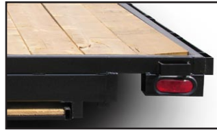
➤ LED Lights