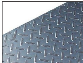
➤ Checkerplate Floor