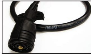
➤ Sealed Wiring Harness