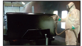
➤ 2k Epoxy Primer / 2k Paint