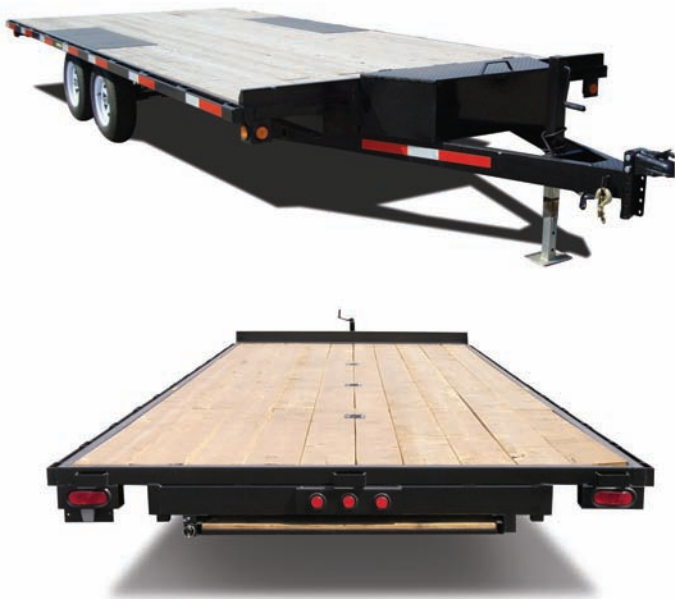
*Trailers in photos may contain optional features