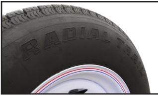
➤ Carlisle Radial Tires

*Trailers in photos may contain optional features