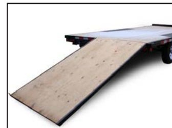
➤ Slide-Under Ramp