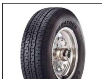
➤ Goodyear Marathon Radial Tires