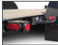
➤ LED Lights