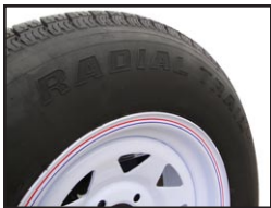
➤ Carlisle Radial Tires

*Trailers in photos may contain optional features