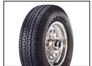
➤ Goodyear Marathon Radial Tires