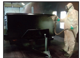
➤ 2K Epoxy Primer/2K Paint