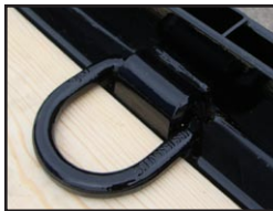
➤ Welded D-Rings