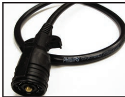
➤ Sealed Wiring Harness