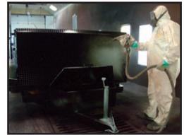
➤ 2K Epoxy Primer/2K Paint