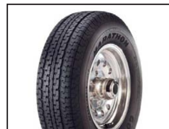
➤ Goodyear Marathon Radial Tires