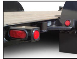
➤ LED Lights