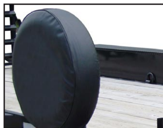
➤ Spare Mounted Tire