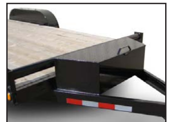
➤ Steel Toolbox