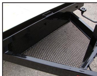
➤ Mesh Tool Tray