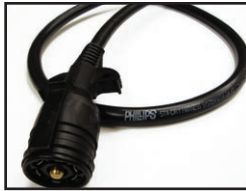
➤ Sealed Wiring Harness