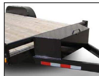
➤ Steel Toolbox