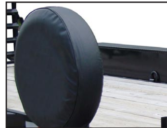
➤ Spare Mounted Tire