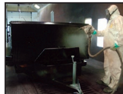
➤ 2K Epoxy Primer/2K Paint