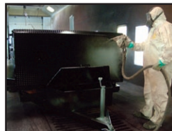
➤ 2K Epoxy Primer/2K Paint