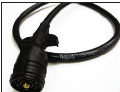
➤ Sealed Wiring Harness