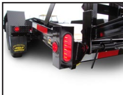
➤ LED Lights