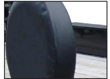
➤ Mounted Spare Tire