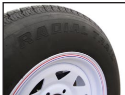
➤ Carlisle Radial Tires

*Trailers in photos may contain optional features