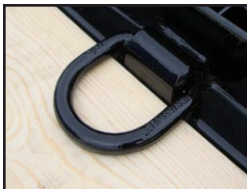
➤ Welded D-Rings