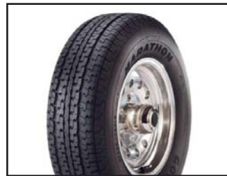
➤ Goodyear Marathon Radial Tires