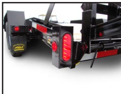
➤ LED Lights