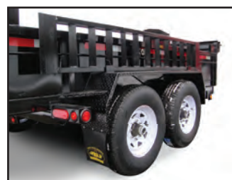
➤ Fender Mount Ramp