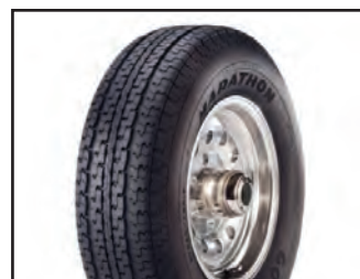
➤ Goodyear Marathon Radial Tires