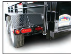
> LED Lights