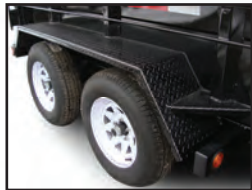
> Checkerplate Fenders