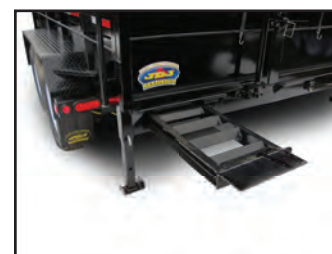
➤ Slide-Under Ramp