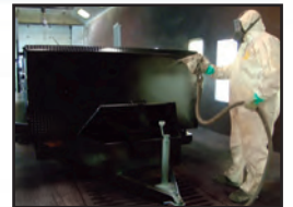
> 2K Epoxy Primer/2K Paint