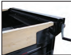
> Tarp and Roller