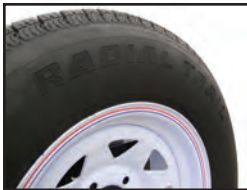
> Carlisle Radial Tires

*Trailers in photos may contain optional features