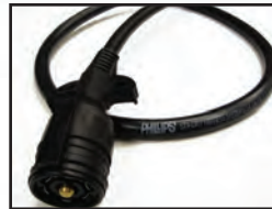
> Sealed Wiring Harness