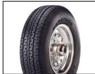
➤ Goodyear Marathon Radial Tires