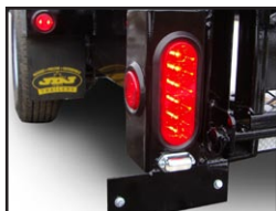
➤ LED Lights