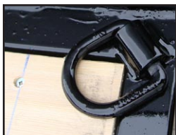
➤ Welded D-Rings