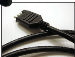
➤ Sealed Wiring Harness