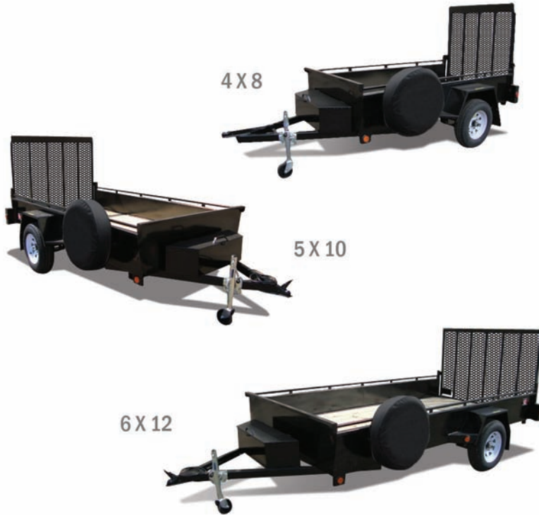
*Trailers in photos may contain optional features