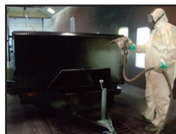
➤ 2K Epoxy Primer/2K Paint