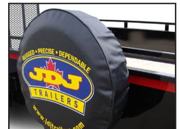
➤ Mounted Spare Tire