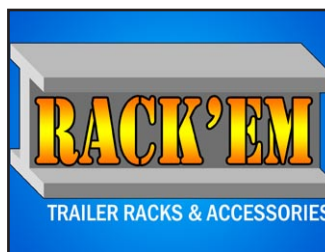
➤ Rack'Em Accessories