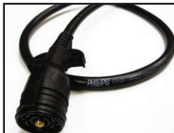
➤ Sealed Wiring Harness