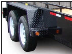
➤ Checkerplate Fenders