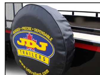
➤ Mounted Spare Tire