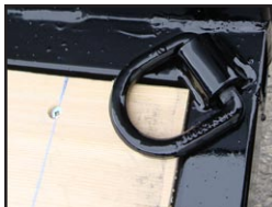
➤ Welded D-Rings