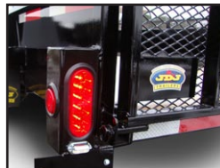
➤ LED Lights