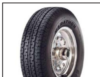
➤ Goodyear Marathon Radial Tires