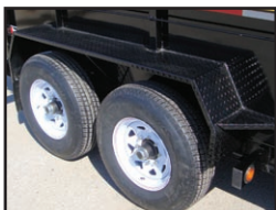
> Checkerplate Fenders