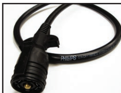
> Sealed Wiring Harness