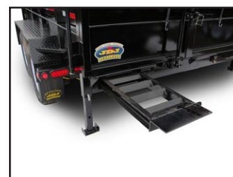
➤ Slide-Under Ramp