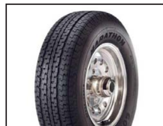
➤ Goodyear Marathon Radial Tires