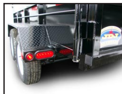
> LED Lights