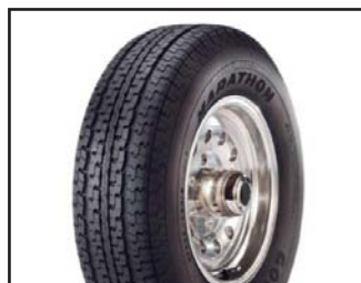
➤ Goodyear Marathon Radial Tires