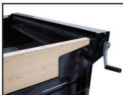
> Tarp and Roller