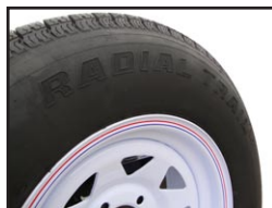
➤ Carlisle Radial Tires

*Trailers in photos may contain optional features