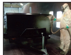
➤ 2K Epoxy Primer/2K Paint