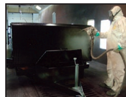
> Carlisle Radial Tires