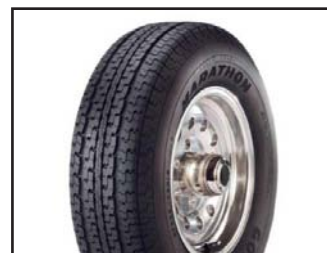
➤ Goodyear Marathon Radial Tires