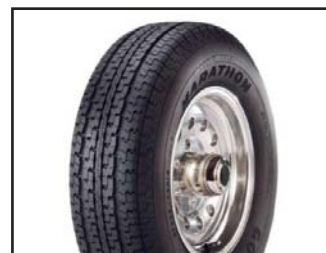
➤ Goodyear Marathon Radial Tires