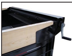
➤ Tarp and Roller