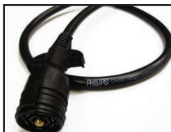
➤ Sealed Wiring Harness