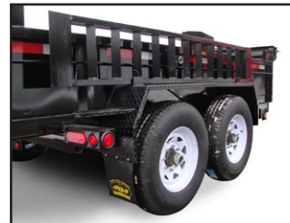
➤ Fender Mount Ramp