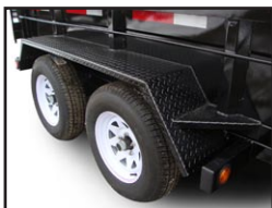
➤ Checkerplate Fenders