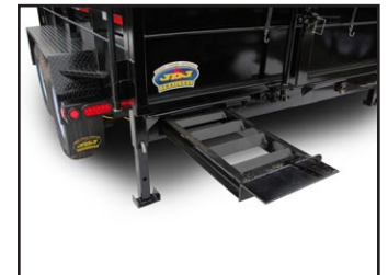
➤ Slide-Under Ramp