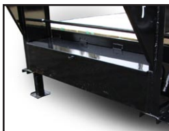
➤ Locking Toolbox