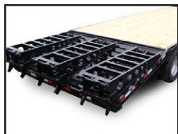
➤ Spring Assisted Ramps

*Trailers in photos may contain optional features