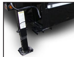
➤ 12000lb Jack