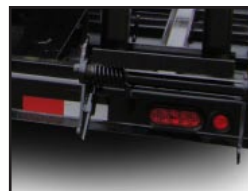
➤ LED Lights